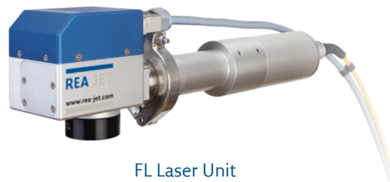
FL Laser Unit