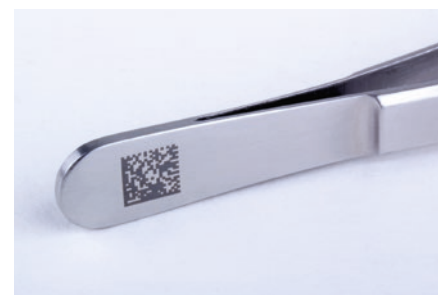
Marking of medical instruments