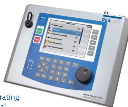
FL Operating Terminal