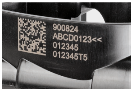
Marking of plastic parts

TITAN The REA JET TITAN Platform. The single operating concept for all REA JET technologies.