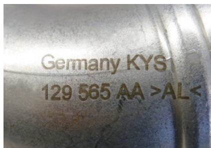
Marking of metal parts