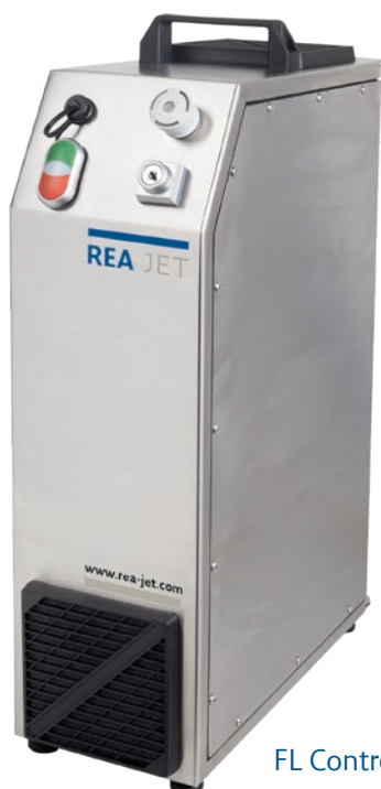
FL Controller Unit