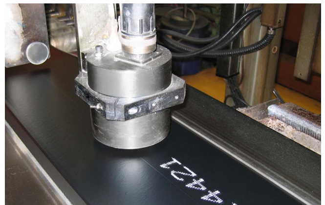
Marking of tread on raw rubber