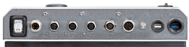
Rear view REA JET DOD 2.0 Control Terminal – port panel