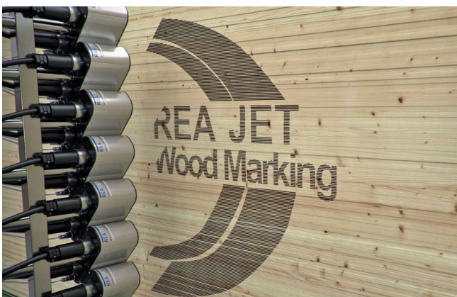
Large marking of logos on stacked boards