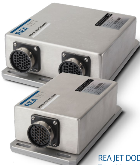
REA JET DOD 2.0 – Print Head Controller Units Top: 32 nozzles, bottom: 7/16 nozzles