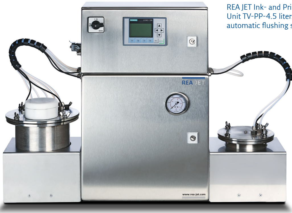
REA JET Ink- and Primer Supply Unit TV-PP-4.5 liters (AFS) with automatic flushing system

REA JET offers various ink and primer supplies - the right solution for every customer requirement.