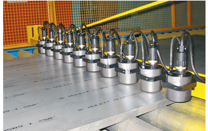
Marking of aluminum plates