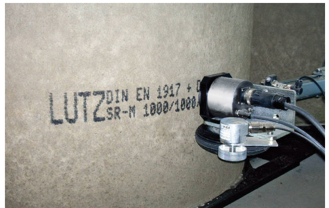
Marking of concrete pipes