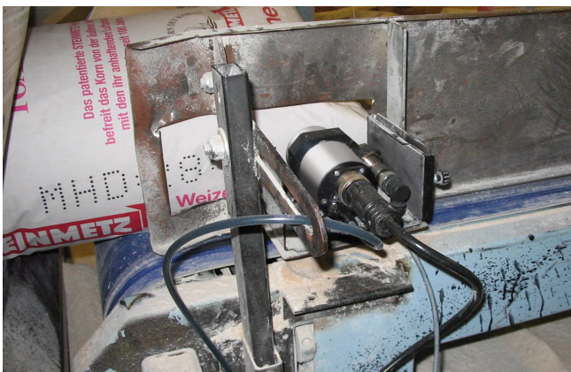
Marking of paper bags